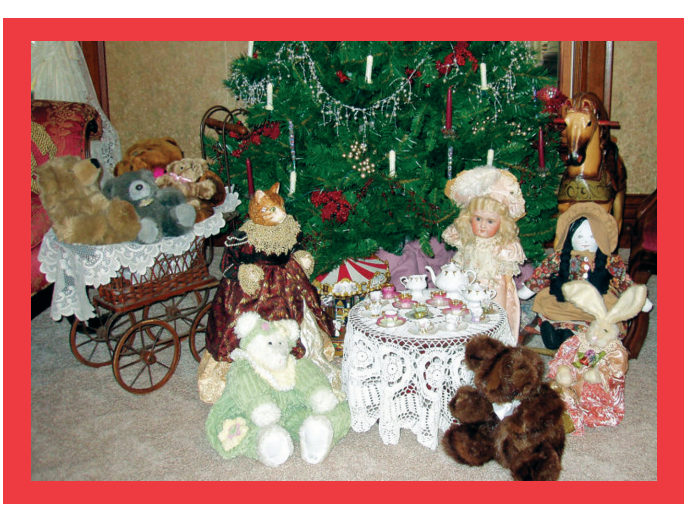
homes hoping to receive an invitation to next year's Christmas tea.

After a wonderful afternoon, the guests departed for their various